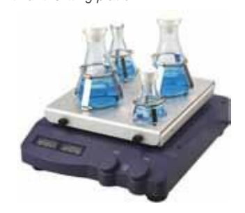
With holed platform and clips for flasks