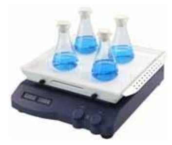
With anti-slitting platform