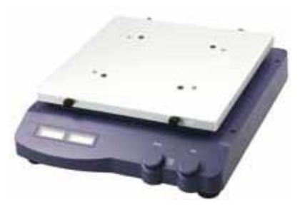
Stirrer without platform