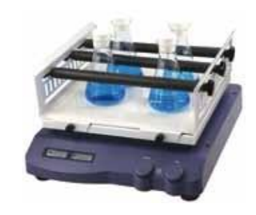
With universal platform with adjustable bars