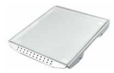
Platform with non-slip material Part number 22006223